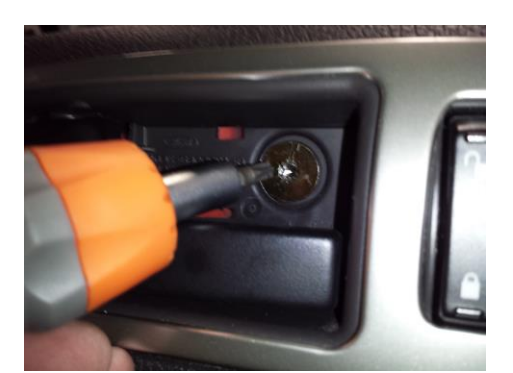
Step 8: Remove the T-30 torx screw behind the door pull and the door handle.