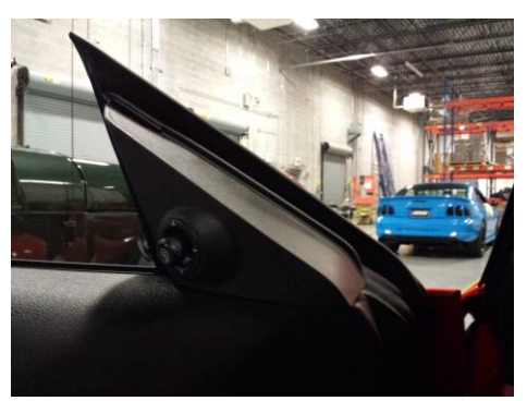
Step 1: Remove the driver's side mirror control panel by pulling away from the door