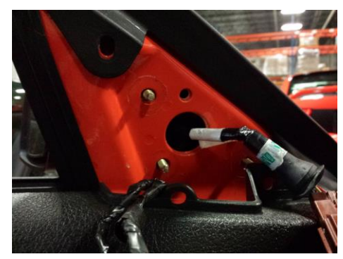
Step 3: Remove the 3 Bolts holding the old mirror in place.