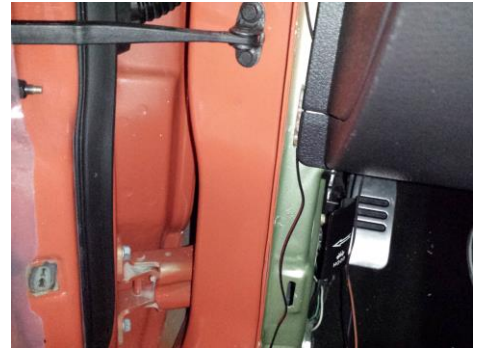
Step 3: Using a stiff wire tool, route the tool into the harness to pull the wires into the interior of the vehicle.