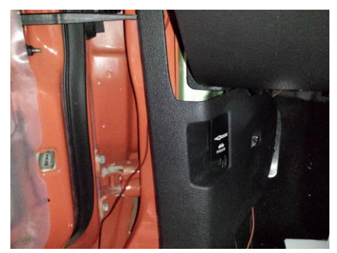
Step 2: Remove the interior kick panels and door sill panels.