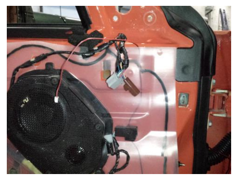
Step 1: Route the wire through the door panel and into the harness that passes through the vehicle.