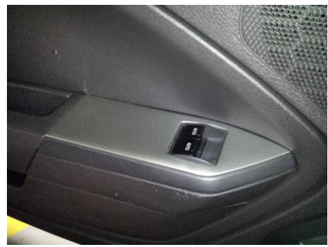
Step 5: Pull the window control assembly towards the interior of the vehicle to remove it.