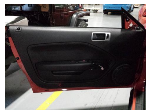
Step 9: Remove the 7mm screws located around the outer part of the door panel and pull the panel up and away from the door.