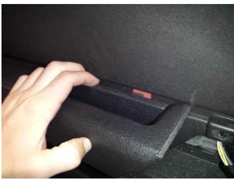
Step 7: Using your fingers or interior trim removal tools, pull the panel behind the door pull out and up to remove it from the vehicle.