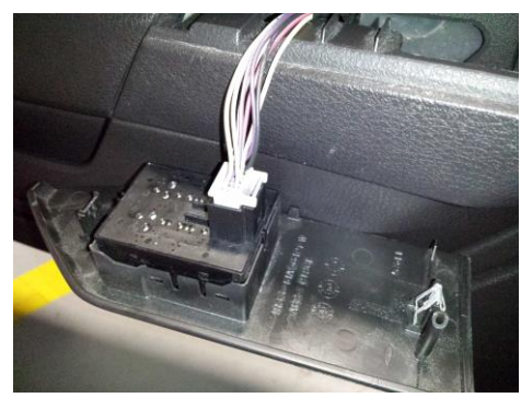
Step 6: Disconnect the wiring harness connected to the window switches and remove the 7mm screw behind it from the vehicle.