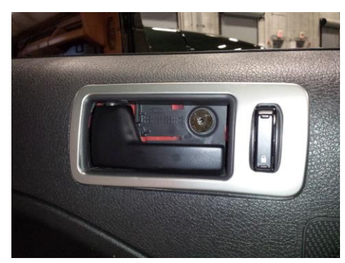
Step 4: Pull the inner door handle out and pop the inner cover out exposing the torx screw below.