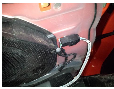
Step 10: Unplug all connectors holding the panel to the door leaving the door handle cable attached.