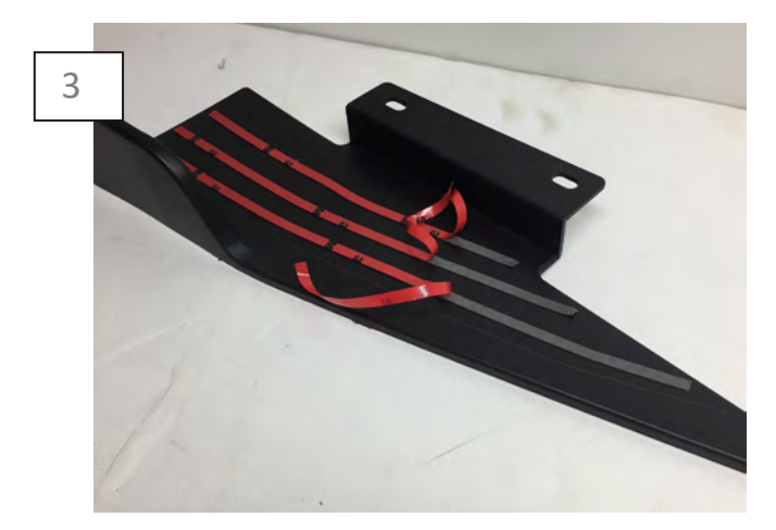
Peel off the tape backing prior to installing the winglet.