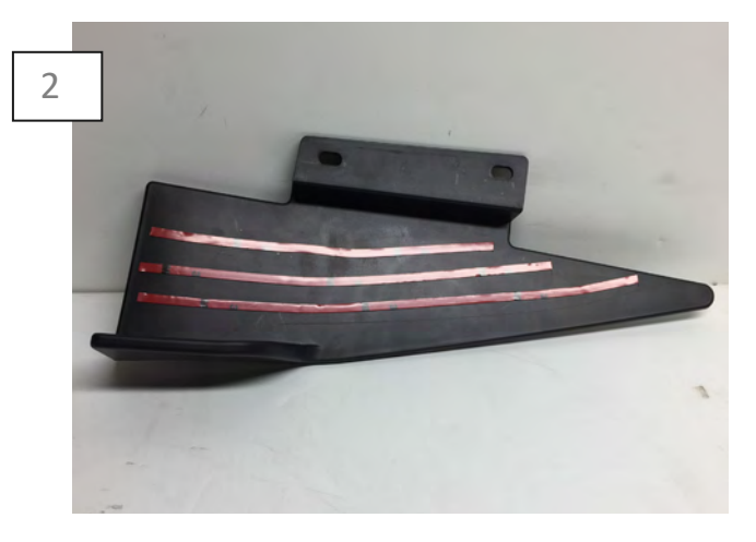
Apply 3M tape the to winglet surface as shown above.