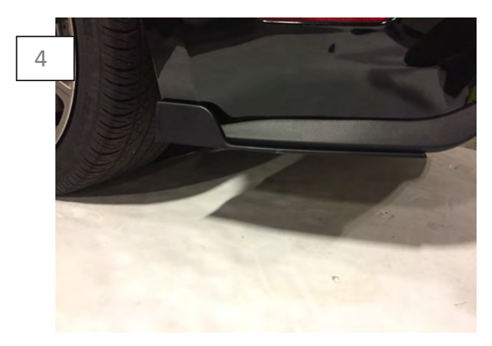
Install the winglet using the factory push clips. **Note: There are a tight fit but they will press all the way in. Apply firm even pressure to the taped surface to ensure proper adhesion.